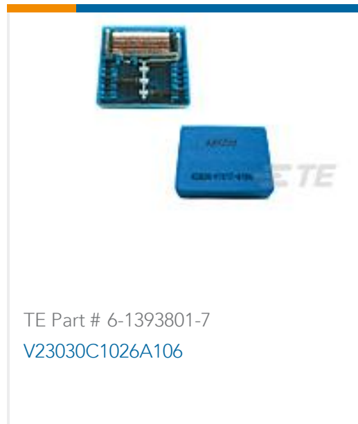
TE Part # 6-1393801-7 V23030C1026A106